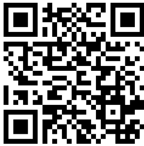
Official Facebook Event

(Note: Links will be officially effective from 15 January 2016 onwards.)